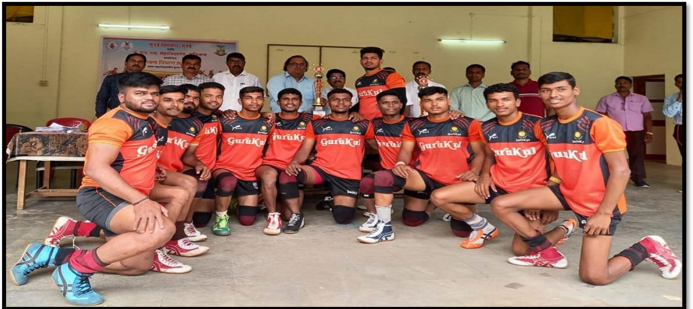
Kabaddi Zonal Round Winner