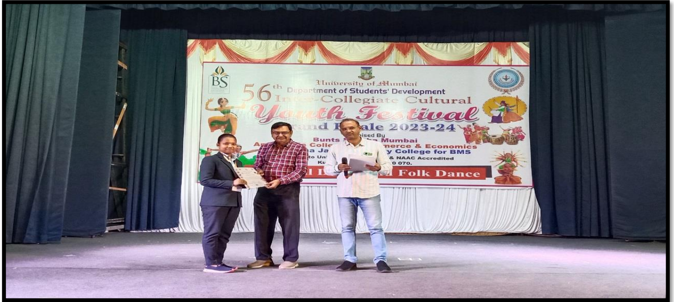
Gold Medal Winner @ Story Writing English