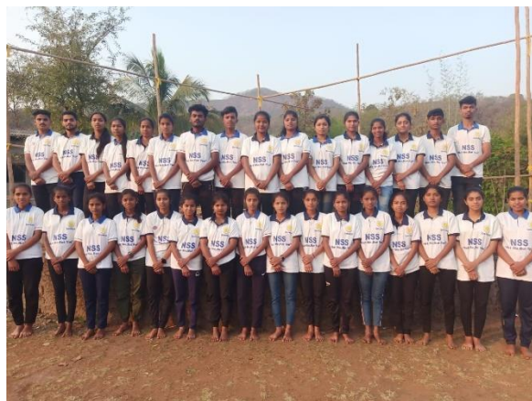
Gurukul College NSS Camp 2023-24 @ Kalkawane Chiplun

Many activities are taken up by the NSS Unit in our college like Disaster Management Training Programmes, Street Plays,Tree Plantation Drives,Blood Donation Camps,Career Guidance Programmes, Seminars on Social Causes.